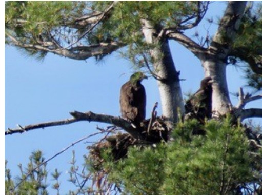
June 12, 2018