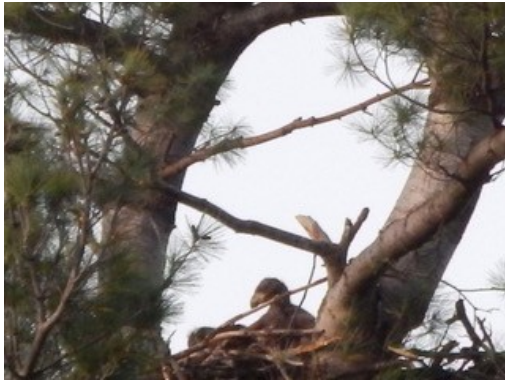
Early May 2018

The chicks are growing up fast. Pictures below show their progress: