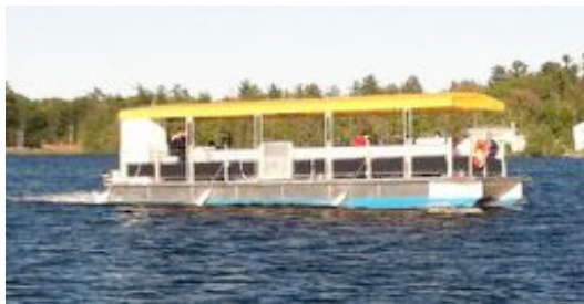
A welcomed sign of summer...The Canobie Park Boat

A 501 – (c) 3 non-profit Charitable Trust in the State of N.H.