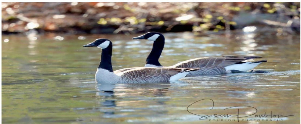
Canadian Geese photo taken by Susan Poulton.