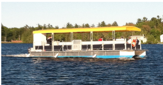
A welcomed sign of summer...The Canobie Park Boat