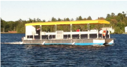
A welcomed sign of summer...The Canobie Park Boat