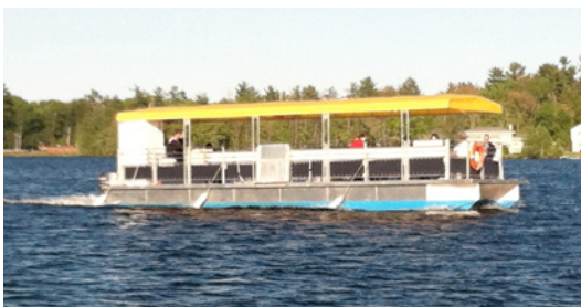
A welcomed sign of summer...The Canobie Park Boat